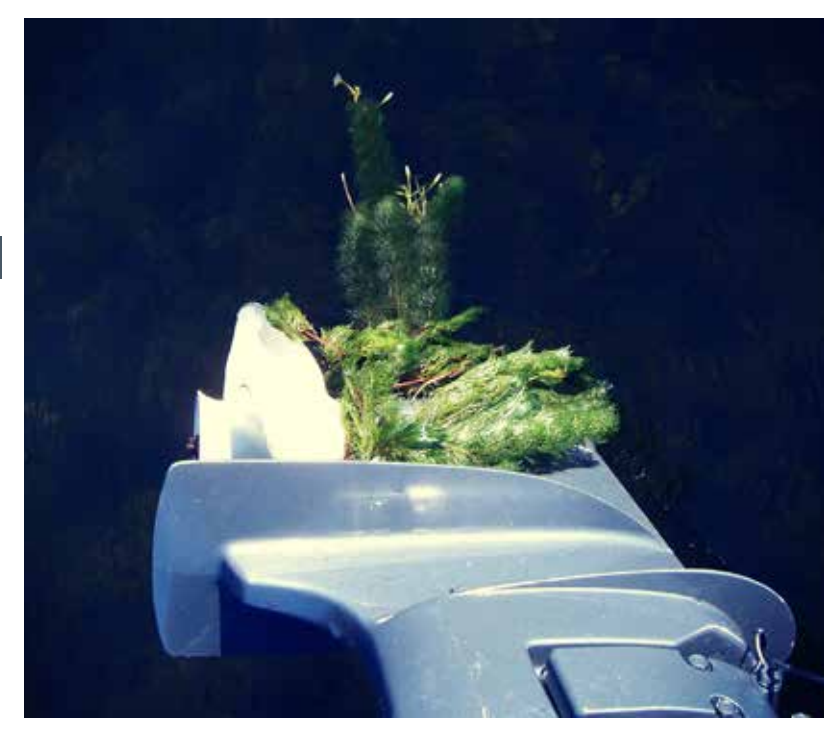
Fanwort (Cabomba caroliniana) on boat motor

Under each recommendation, the Task Force has identified key activity areas and a number of examples of priority tasks that would help to address high-risk activities, pathways, or geographic locations. These are based on the priorities identified by the Task Force and on feedback from partners and stakeholders, and will need to be confirmed and prioritized by the CWBSG and are conditional on the approval of work-plans and associated budgets by each government.