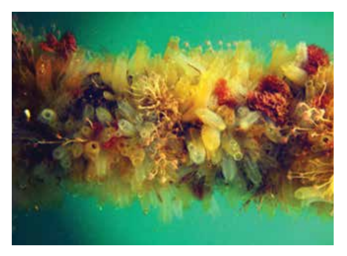
Vase tunicate (Ciona intestinalis)

Build strategic partnerships; communicate and educate; build capacity; share information and data; strengthen funding