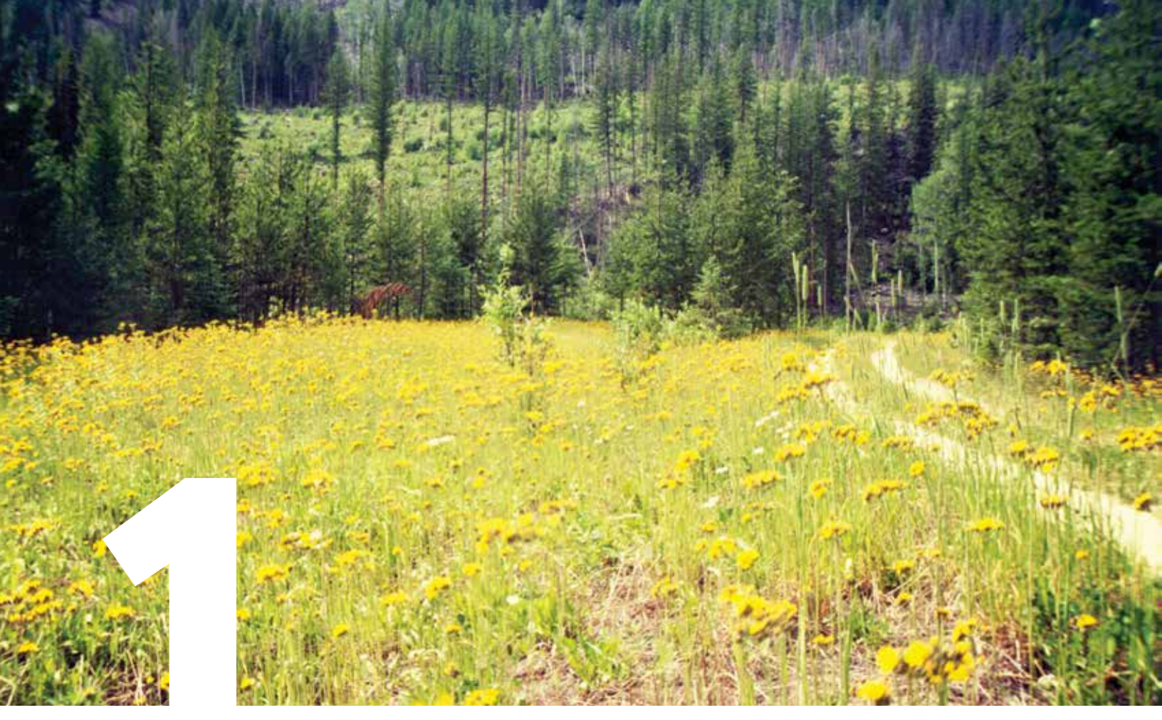
Hawkweed (Hieracium spp) invades a forest cut block in British Columbia