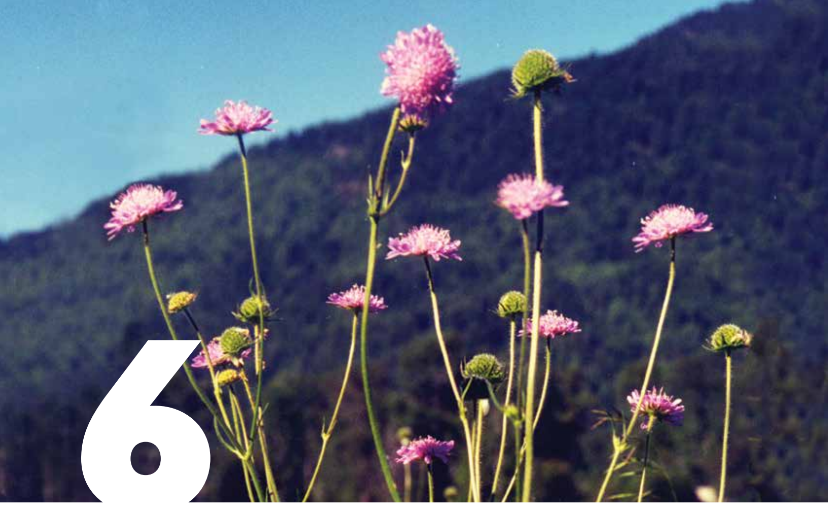
Field scabious (Knautia arvensis)