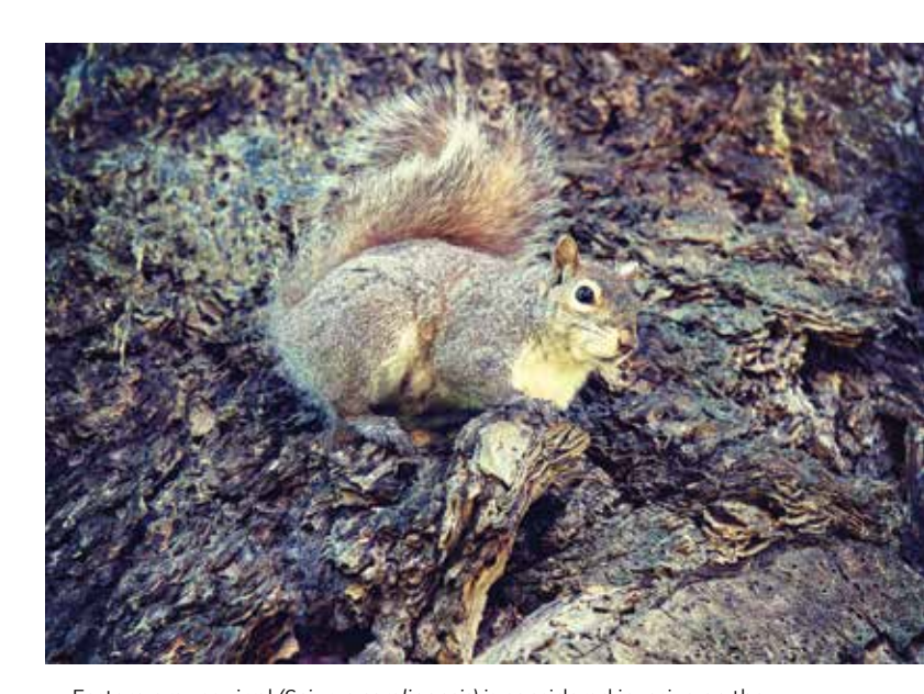
Eastern grey squirrel ( Sciurus carolinensis ) is considered invasive on the west coast as they displace native squirrels and birds from their habitats

Coordinated actions and secure resources are vital to enable timely and effective responses to invasive species. Coordination is required across all jurisdictions while recognizing that each level of government has distinct regulatory responsibilities and private sector also plays a critical role for success. Diverse financial resources are required from all levels of governments and private sources, especially those involved with 'pathways of spread'.