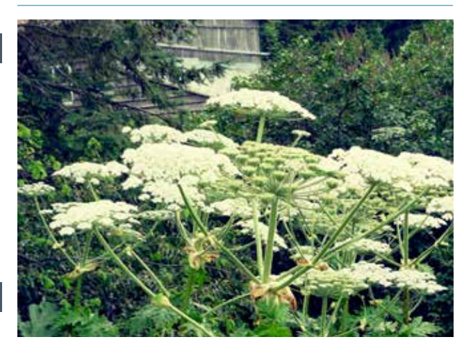
Giant hogweed ( Heracleum mantegazzianum )