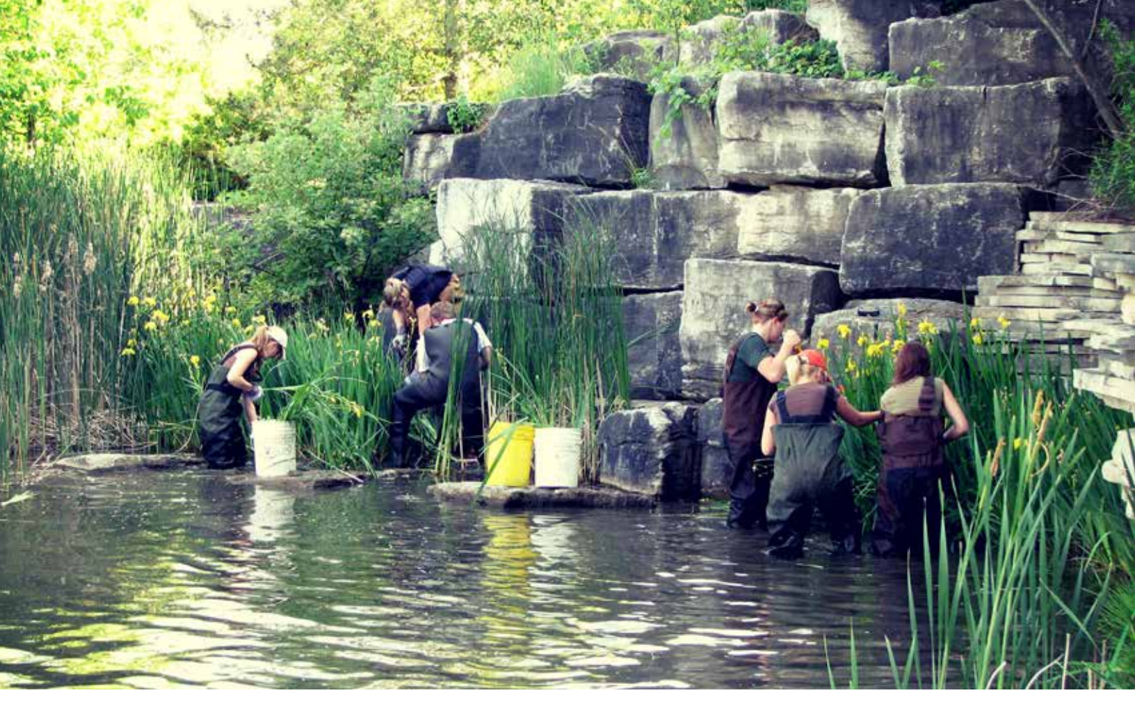
Yellow iris ( Iris pseudacorus ) removal by volunteers in Ontario