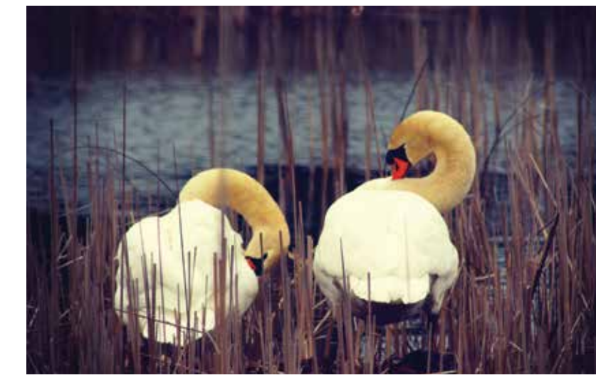
Mute swan (Cygnus olor)

To further support the goals of the Strategy, Ministers responsible for Conservation, Wildlife and Biodiversity established a representative federal-provincial-territorial (FPT) Invasive Alien Species (IAS) Task Force to identify priority actions to better position Canadian efforts. To ensure a national perspective on priority actions, the IAS Task Force, in partnership with the Canadian Council on Invasive Species, held a national workshop on February 25, 2016 to share perspectives on priorities and potential actions to improve invasive alien species prevention and management in Canada. There were 50 participants including representatives from various levels of government, industry, provincial and territorial invasive species councils, academia and other non-governmental and non-profit organizations. Presentations provided an overview of progress on implementation of the Strategy, and shared the results of jurisdictional scans of FPT governments, and invasive species councils on key priorities and actions.