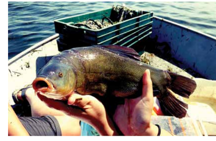
Tench (Tinca tinca)

Under this recommendation, the Task Force suggests three focus areas. The first focus is the development of a national Framework for EDRR initiatives, under the leadership of the IAS National Committee. It would provide guidance on how to respond to new invasive species across the full continuum of emergency management, from preparation through to restoration, but it would not be prescriptive. This guidance would build on and ensure linkages to existing frameworks within Canada (e.g., BC Invasive Species EDRR Plan, draft Decision Support Framework for Forestry Invasive Pests, Emergency Management Framework for Agriculture in Canada), the United States (e.g., National Framework for Early Detection and Rapid Response, Guidelines for the Establishment of Early Detection and Rapid Response Systems), and elsewhere in the world (e.g., New Zealand's national biosecurity surveillance program). This national framework could also build on plans established in other areas, such as intervention plans for natural disasters.