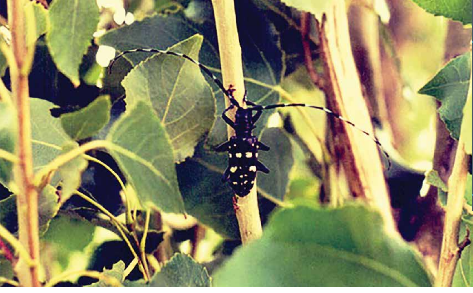
Asian longhorned beetle (Anoplophora glabripennis)