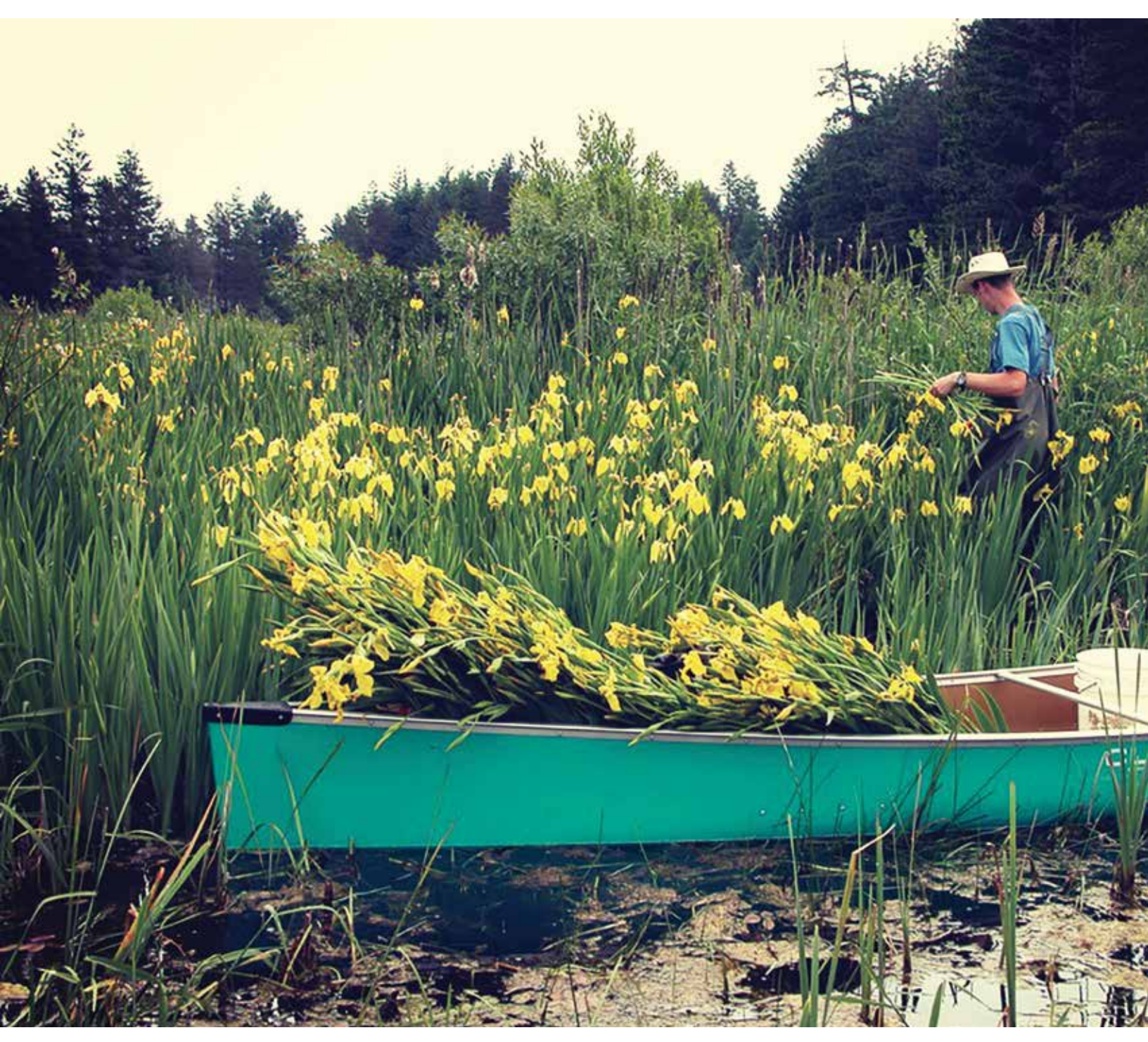
Yellow flag iris ( Iris pseudacorus )