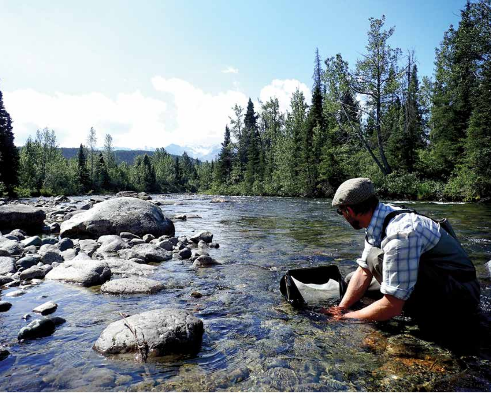
Studying the effects of Didymo algae ( Didymosphenia geminata) on benthic invertebrates and fish habitat in Million Dollar Falls, Yukon