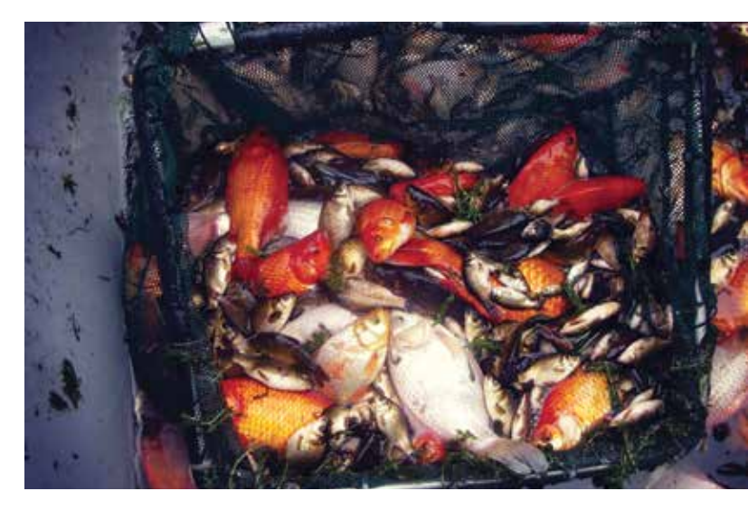
Goldfish (Carassius auratus) captured in an urban pond in Quebec City