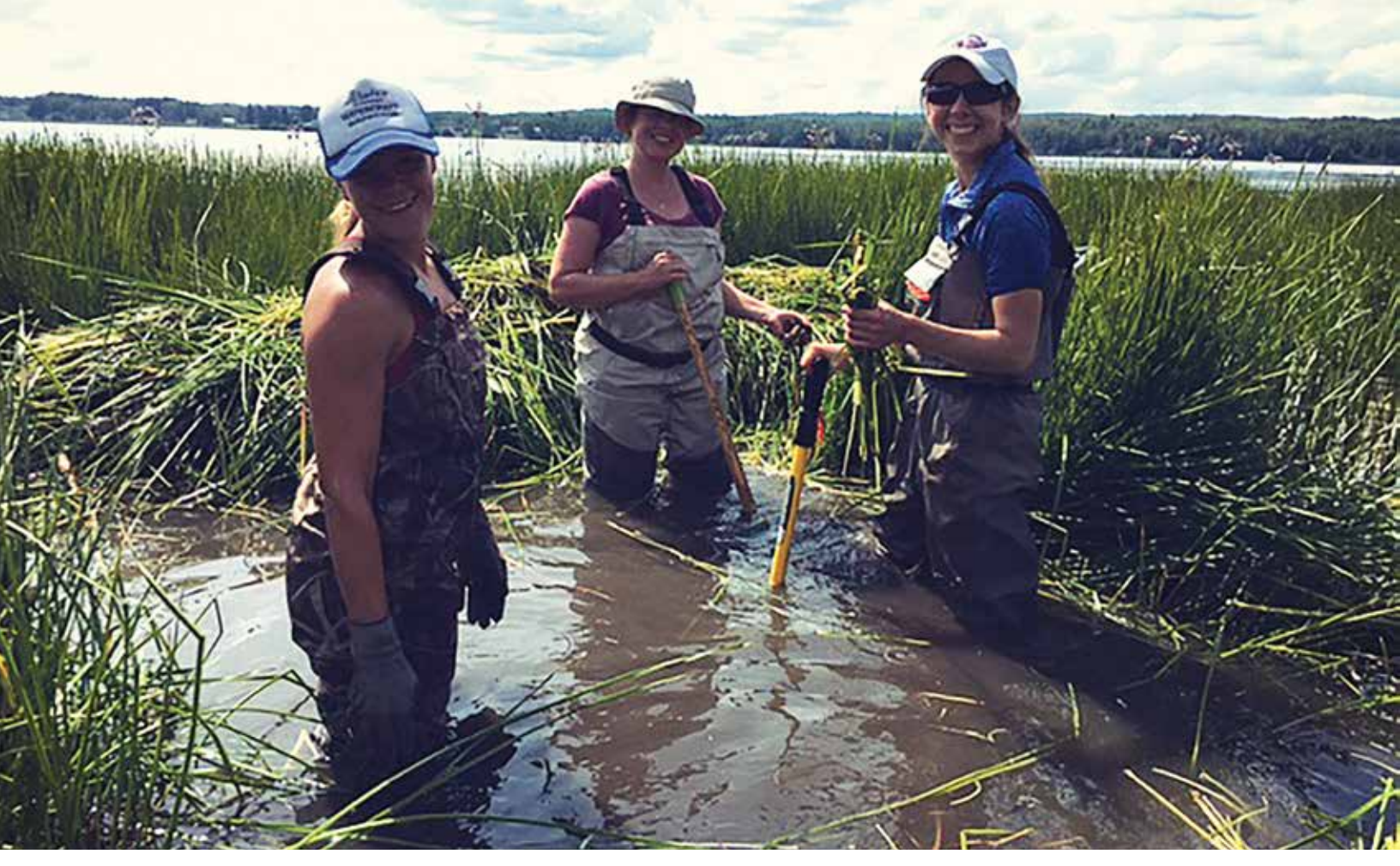
Flowering rush (Butomus umbellatus) control trials at Lake Isle, Alberta