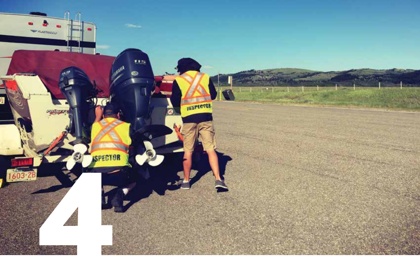
Watercraft inspection stations to prevent the introduction and spread of zebra mussels to Alberta