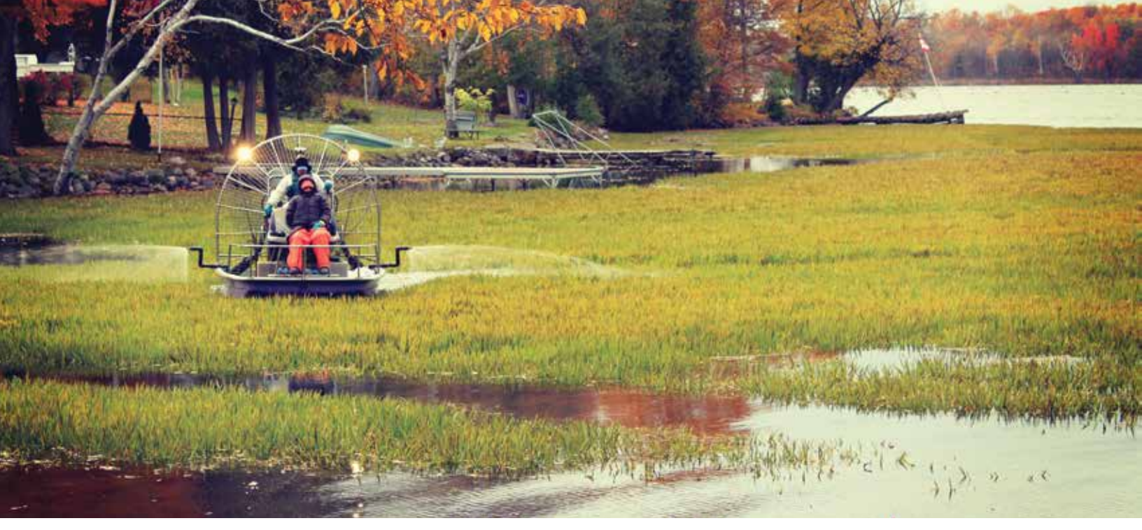
Air boat applying herbicide to eradicate Water soldier (Stratiotes aloides) in the Trent Severn Waterway