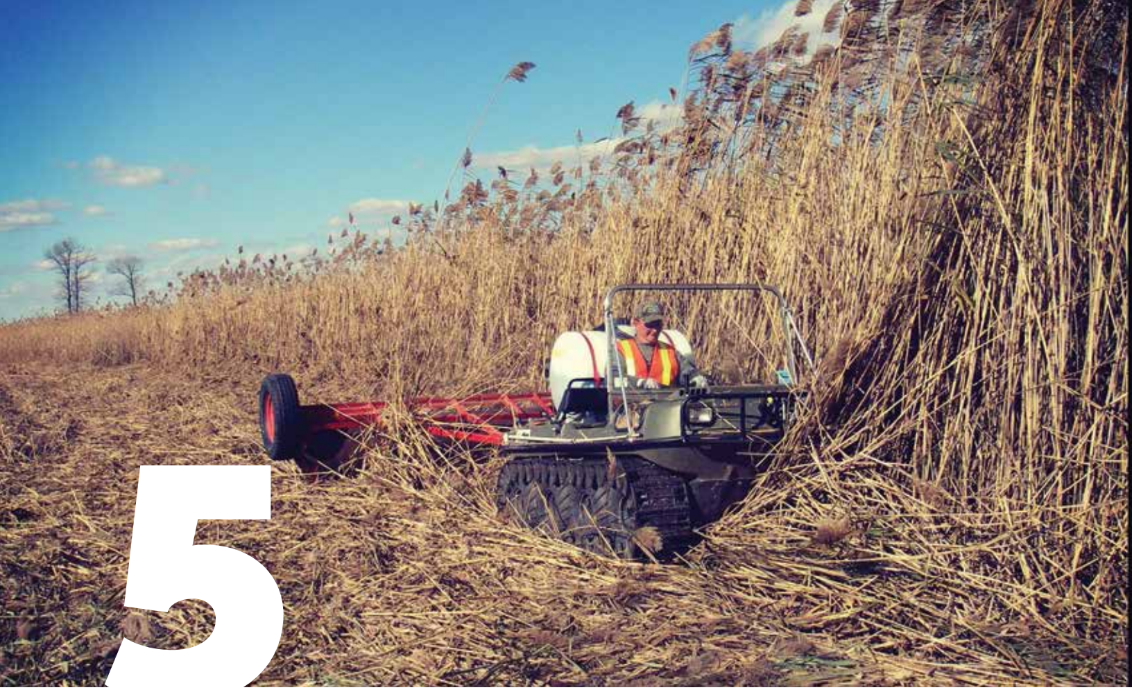
Common reed ( Phragmites australius ) control in a Great Lakes coastal wetland in Ontario