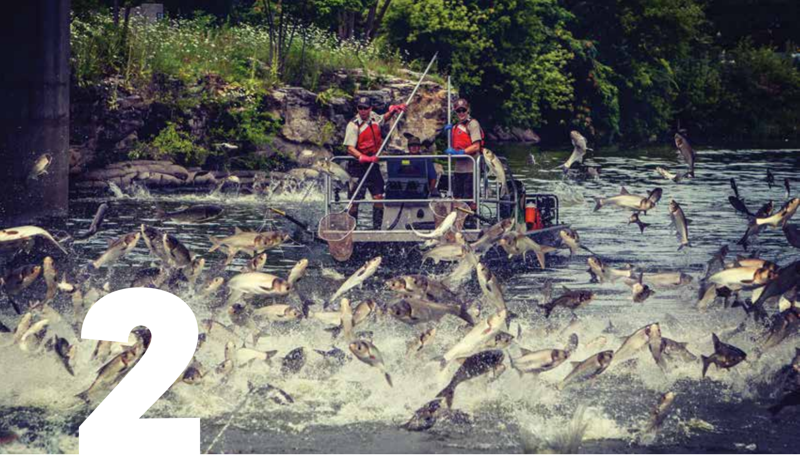
Silver carp (Hypophthalmichthys molitrix) an invasive fish, seen here in the U.S. waters of the Mississippi River, is the focus of a bi-national effort including the U.S. and Canadian federal, state and provincial agencies to prevent its introduction to the Great Lakes basin