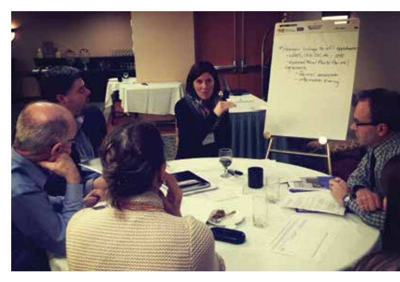
National IAS workshop

The Workshop Report was also sent to more than 135 additional stakeholders for review and comment. The executive summary from the report is presented in Appendix 5.