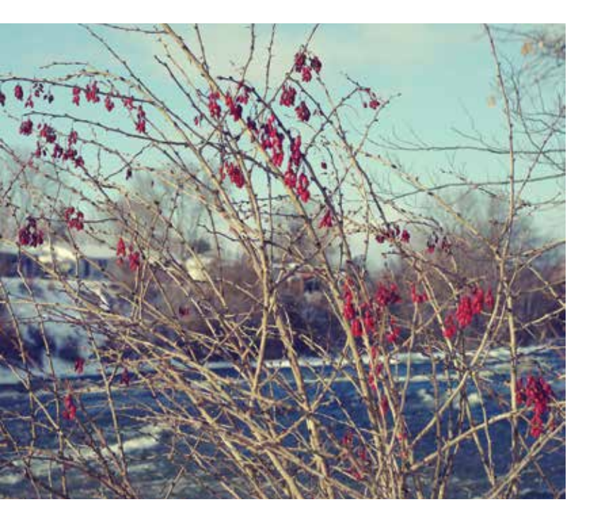
Common barberry ( Berberis vulgaris )