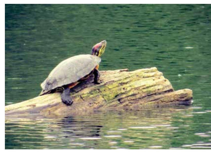
Red eared turtle ( Trachemys scripta elegans) in Valleyfield near Montreal

The National Committee would report to the ADM Conservation, Wildlife, and Biodiversity Steering Group (CWBSG), who would ensure that other ministers' councils are kept informed on key files. National Committee membership would continue to include representatives from federal, provincial and territorial governments and the other FPT IAS Committees, but would be expanded to include additional federal agencies, for example, the Canada Border Services Agency, the Pest Management Regulatory Agency, and Agriculture and Agri-food Canada. It would be the responsibility of National Committee members to maintain linkages to other inter-jurisdictional and interdepartmental IAS committees to ensure that work is aligned and complementary.