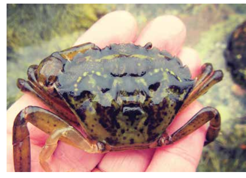
Green crab (Carcinus maenas) in Passamaquoddy Bay, New Brunswick

Table 3 illustrates example of priority actions under each key focus area. This is intended to create a foundation on which to build long-term, collaborative partnerships with others. These are not actions that would be undertaken solely by the National Committee; rather, the National Committee could lead, support, or collaborate with external partners as appropriate for the particular action and available resources. Invasive alien species affect everyone, from regulatory agencies, to business and industry, to the general public. Strengthening collaboration and empowering others to take action improves efficiency and enhances outcomes for everyone. Table 3 summarizes proposed focus areas with example priority tasks.