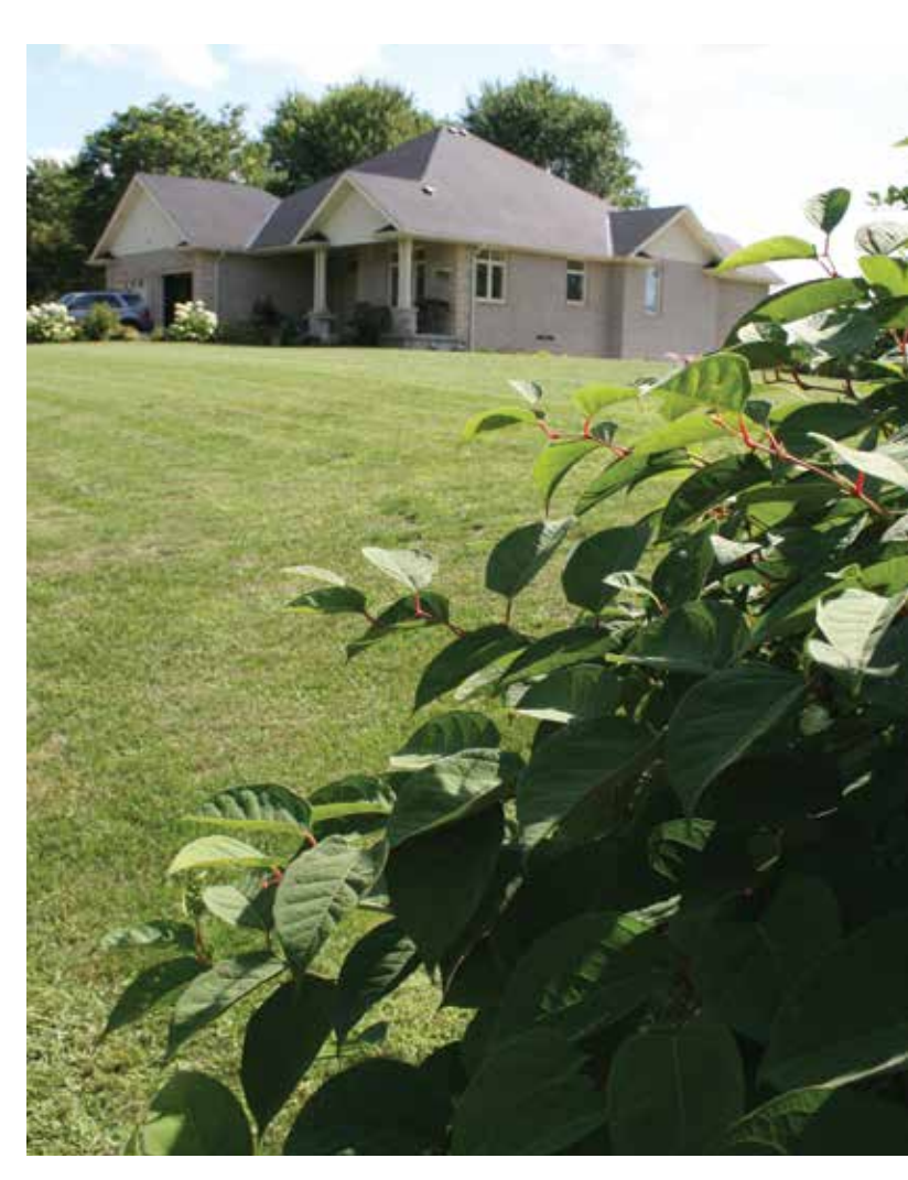
Japanese knotweed ( Reynoutria japonica )