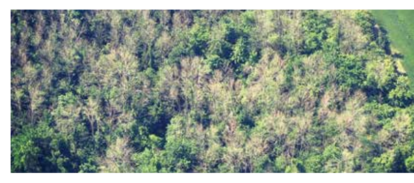
Aerial photo of an ash stand severely damaged by emerald ash borer

important to strengthen and enhance mechanisms that support implementation of the Strategy, and its objectives of prevention, early detection, rapid response and management of IAS.