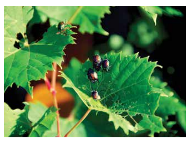
Japanese beetle ( Popillia japonica )